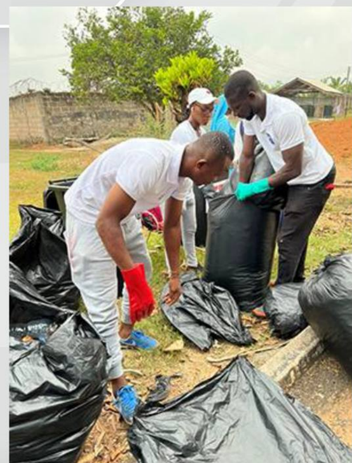
Volunteers bag up the plastic waste during an hour of cleanup on the hospital grounds.

the climate. Through the initiative, clubs are working together to address and prevent the full-cycle problem of plastic pollution.