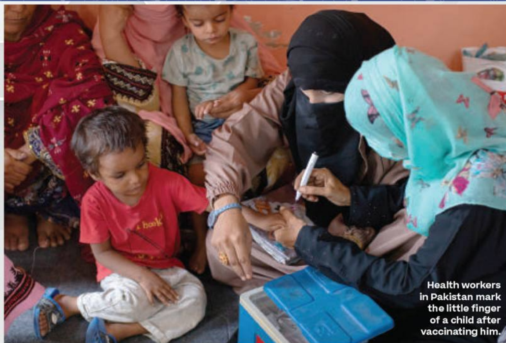
Health workers in Pakistan mark the little finger of a child after vaccinating him.